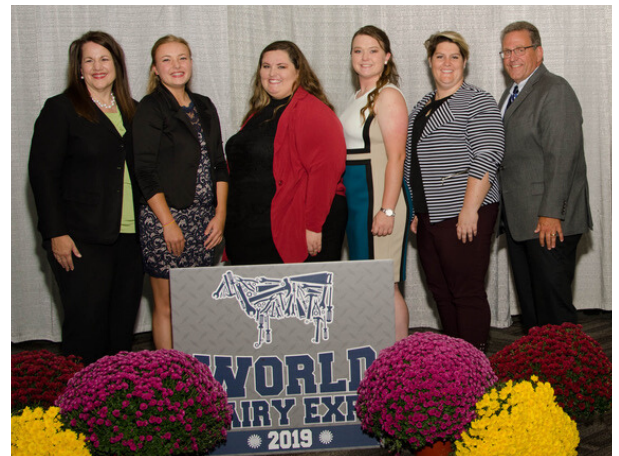
Ag Tech Team